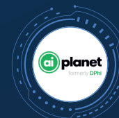
AI Planet for Education